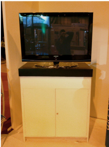
Plasma and secure storage unit